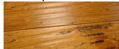
Hickory Pecan 'Copper City'