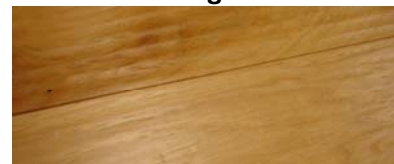
Hickory Pecan 'Natural'