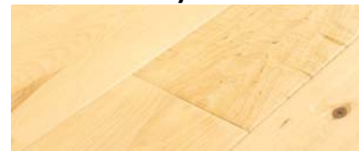
Birch 'Glacier Peak'