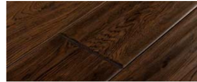
Oak 'Canyon Creek'